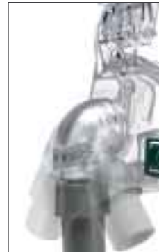
360° elbow rotation lets you choose the most convenient tube position