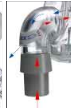
Unique air vent design reduces noise by directing the flow of air that is being inhaled and exhaled